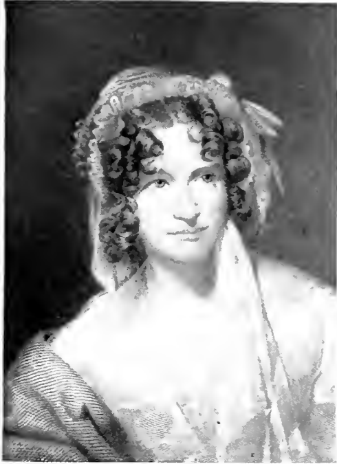
SARAH HELEN WHITMAN.

(1873); "Sights and Insights" (1876); "Just How: A Key to Cook-Books" (1878); "Odd or Even" (1880); "Bonnyborough" (1885); "Homespun Yarns," "Holy-Tides" (1886); "Daffodils" and "Bird-Talk" (1887). The last three volumes